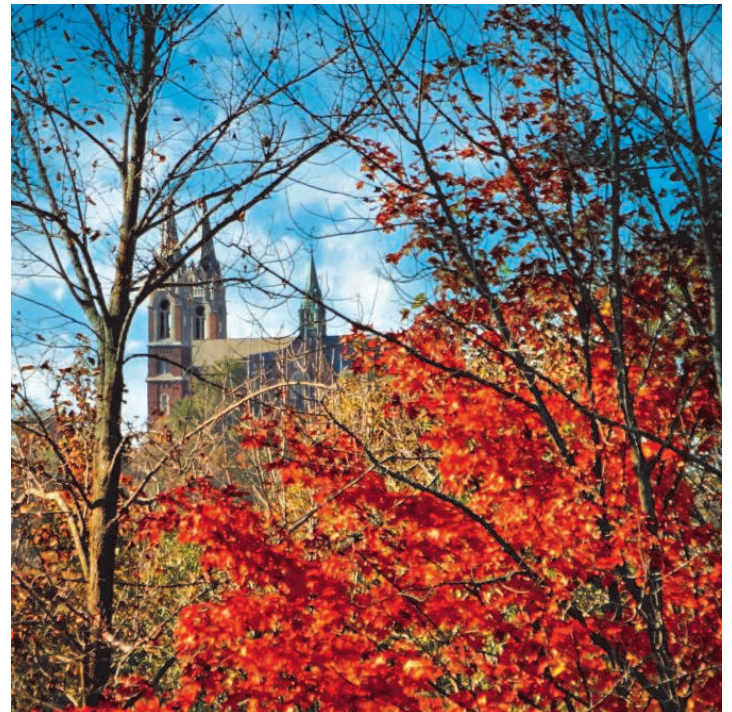
Fall colors are spectacular this season