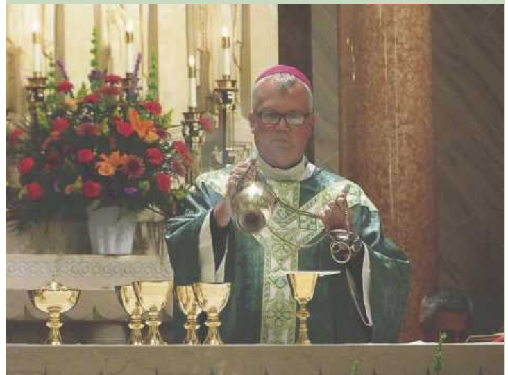
Celebrating Mass at Holy Hill on October 25, 2014