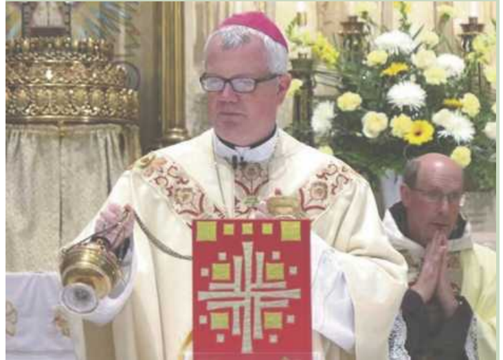
Celebrating Mass at Holy Hill on June 22, 2014